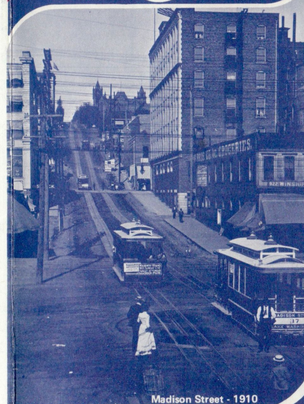
Madison Street - 1910